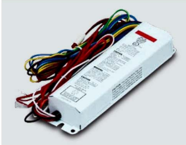
(All ballasts are standard with dual 120/277 input)