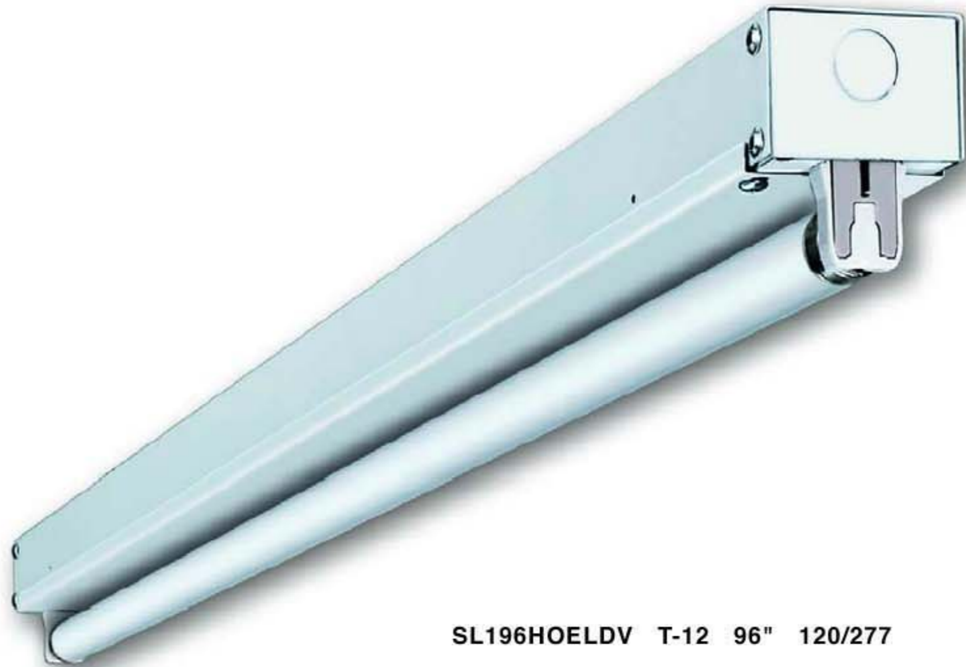
SL196HOELDV T-12 96" 120/277